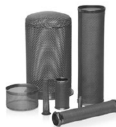
SS Mesh basket