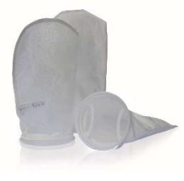
BREWBag Filter Bags