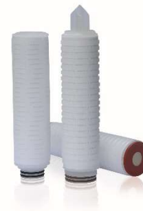
STERIPleat Vent 0.2 micron Sterilising Grade Membrane